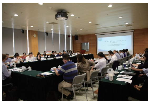
The 2 nd Coordination Meeting of the BRI International Green Development Coalition

The meeting set up the framework of the Case Study report, which includes the executive summary, case analysis, as well as conclusion and outlook. The executive summary will introduce the goal of the report, i.e. sharing cases, exhibiting ambition and promoting exchange and mutual learning with emphasis laid on illustrating the indicators adopted when selecting cases, including compliance, effectiveness, degree of recognition, and whether it can be widely adopted. For the case analysis part, cases are selected in 6 areas, including pollution treatment and prevention, ecosystem management and conservation, green energy, green consumption, green production and green finance. The shared properties and characteristics of specific successful cases will be summed up based on which future development will be projected in the part of conclusion and outlook.