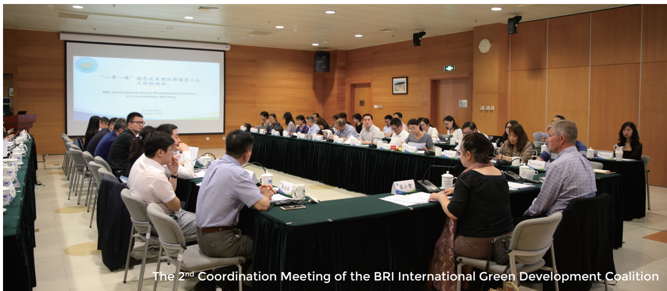
The 2 nd Coordination Meeting of the BRI International Green Development Coalition

Secretariat of BRI International Green Development Coalition