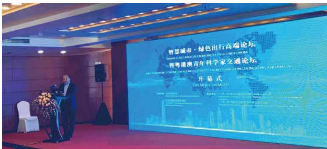
The Smart Cities and Green Mobility High-End Forum and Transport Forum for Young Scientists from Guangdong, Hong Kong and Macau was held in Shenzhen

(Source: Thematic Partnership of Sustainable Transportation)