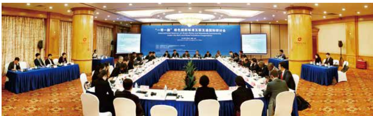
The International Seminar on Green Rules and Standards Connectivity under the Belt and Road Initiative Cooperation was held in Changsha, Hunan Province