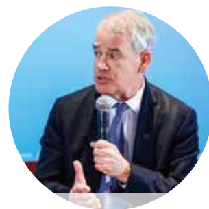
Sean Kidney, CEO of Climate Bonds Initiative

Countries along the Belt and Road are looking forward to related development opportunities. The BRI and the leadership of China impressed all related countries. Currently, the most important task is to promote public private partnership with the participation of all sides. It is important for China to share its practices and experience with BRI countries and set up reasonable long-term goals.