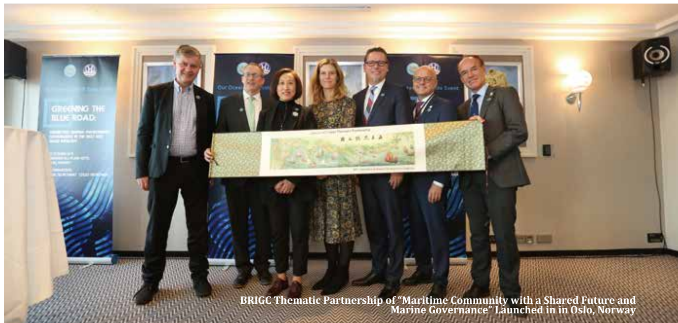
BRIGC Thematic Partnership of "Maritime Community with a Shared Future and Marine Governance" Launched in Oslo, Norway

Secretariat of BRI International Green Development Coalition