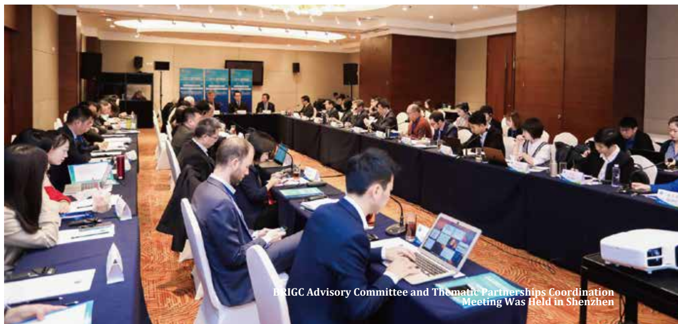
BRIGC Advisory Committee and Thematic Partnerships Coordination Meeting Was Held in Shenzhen

Secretariat of BRI International Green Development Coalition