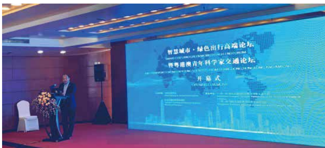
The Smart Cities and Green Mobility High-End Forum and Transport Forum for Young Scientists from Guangdong, Hong Kong and Macau was held in Shenzhen