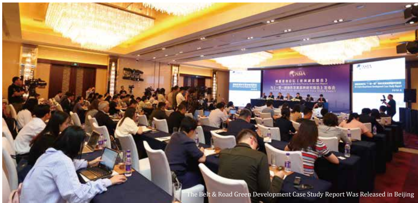
The Belt & Road Green Development Case Study Report Was Released in Beijing

Secretariat of BRI International Green Development Coalition