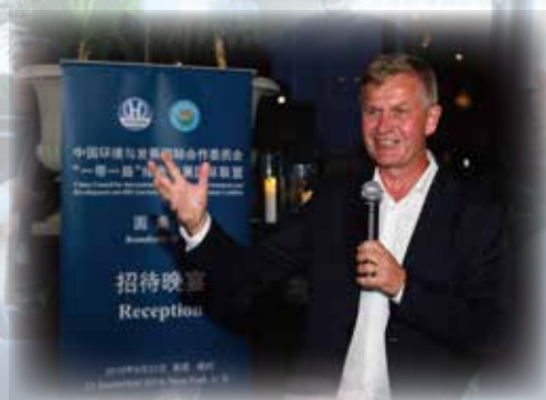
Mr. Erik Solheim, CCICED Vice Chairperson, Convener of Advisory Committee of BRIGC, Advisor of WRI