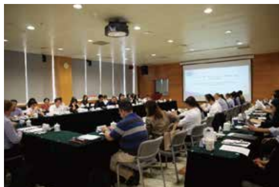
The 2 nd Coordination Meeting of the BRI International Green Development Coalition

The meeting set up the framework of the Case Study report, which includes the executive summary, case analysis, as well as conclusion and outlook. The executive summary will introduce the goal of the report, i.e. sharing cases, exhibiting ambition and promoting exchange and mutual learning with emphasis laid on illustrating the indicators adopted when selecting cases, including compliance, effectiveness, degree of recognition, and whether it can be widely adopted. For the case analysis part, cases are selected in 6 areas, including pollution treatment and prevention, ecosystem management and conservation, green energy, green consumption, green production and green finance. The shared properties and characteristics of specific successful cases will be summed up based on which future development will be projected in the part of conclusion and outlook.