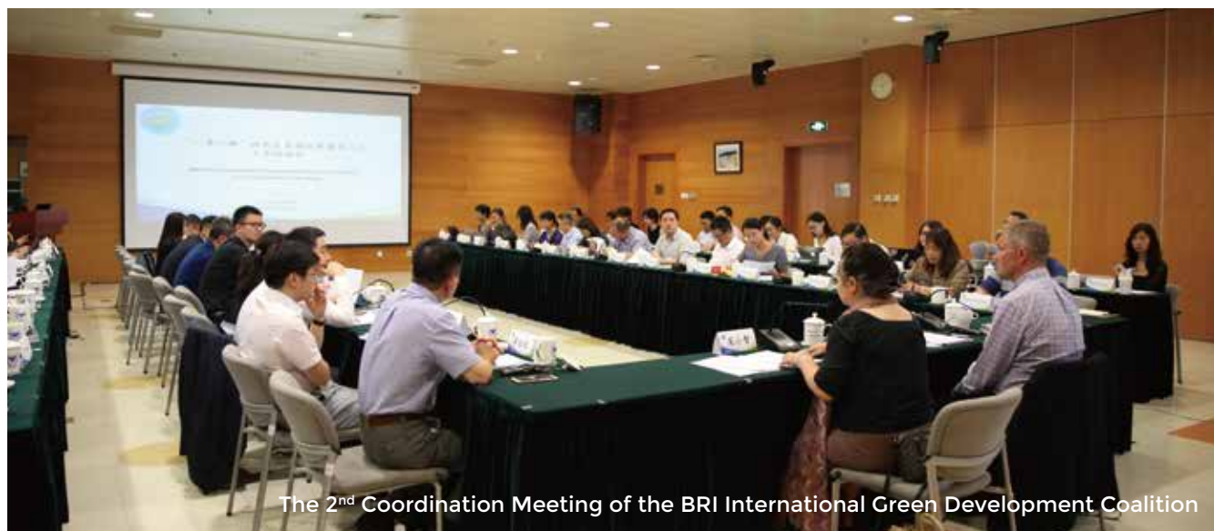
The 2 nd Coordination Meeting of the BRI International Green Development Coalition

Secretariat of BRI International Green Development Coalition