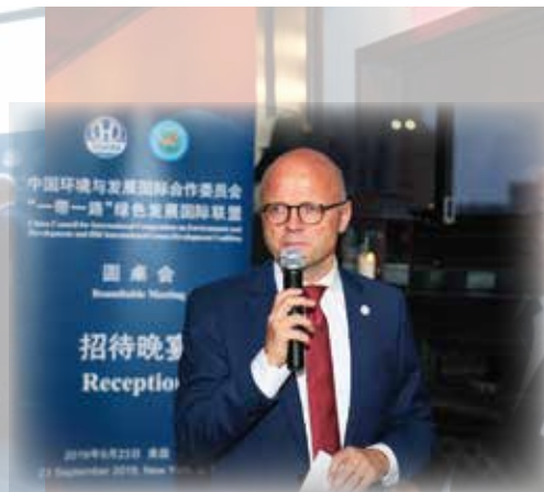
Mr. Vidar Helgesen, CCICED Vice Chairperson, Co-Chair of BRIGC, Norway's Special Envoy to the High-level Panel on Building a Sustainable Ocean Economy