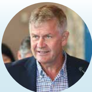
Mr. Erik Solheim, CCICED Vice Chairperson, Convener of Advisory Committee of BRIGC, Advisor of WRI

As green BRI and 2030 Agenda for Sustainable Development are highly consistent in terms of concepts, principles and goals, there is an obvious synergy between them. We should encourage more private enterprises to take part in the green BRI cooperation, enabling it to play a greater leading role.